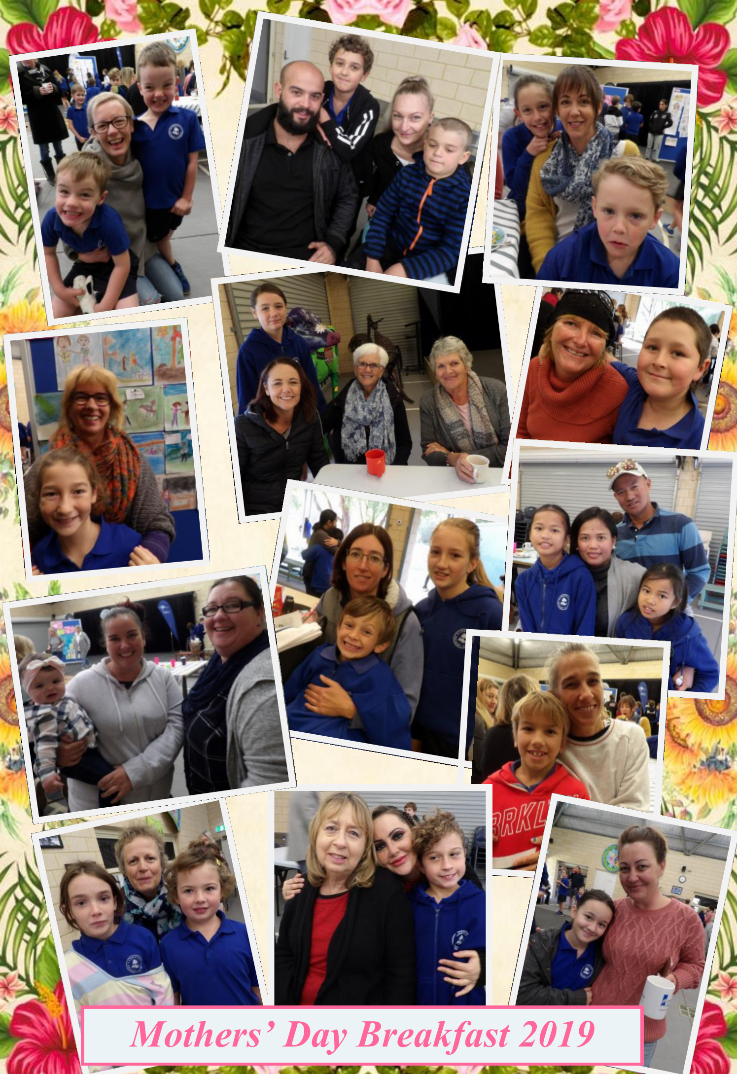
Mothers' Day Breakfast 2019