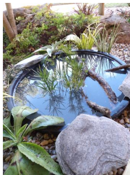
Above: Our lovely new frog pond installed outside Room 2.

"Acceptance is the harshest lesson life teaches and the one most important to learn."