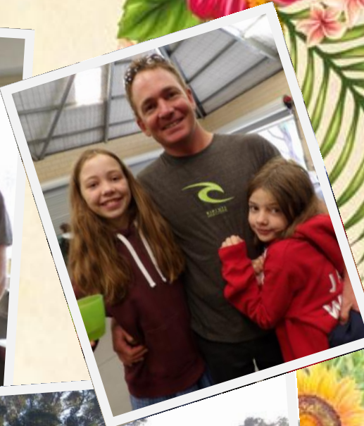
The Men's Utes