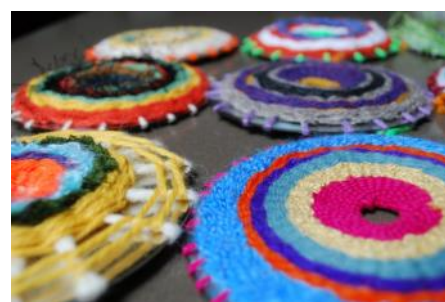
Above: Donations of old CD's and other materials for CD loom weaving activity are sought before the end of Term 4.

We wish to thank ERGA for the kind donation of their publication to our school library.