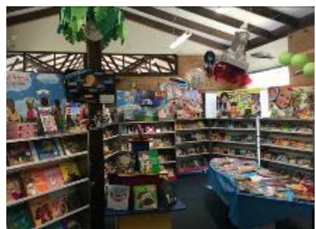
Above: Book Fair set up in the school library.