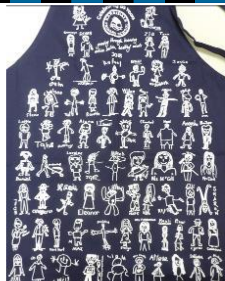
Above: Our 135 year Commemorative Apron