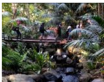
Exploring the Asian Rainforest at Perth Zoo