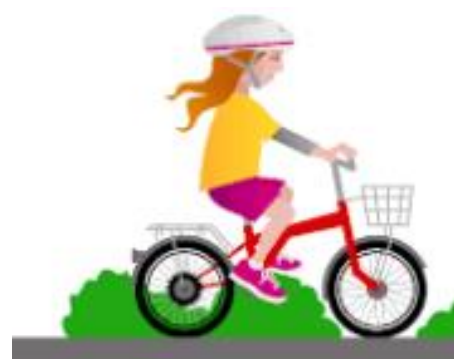
Above: Road Safety Awareness Oct 11 and 13

Contact the CRC or visit their Facebook page for more details and RSVPs.