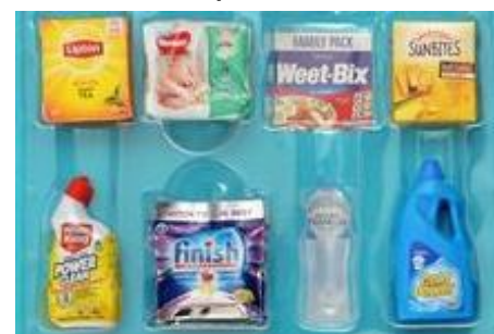
Donate your extra items to Mrs McGill

classroom is also always on the lookout for sturdy shoeboxes or strong, small storage container. If you have any you can donate, please drop them down to the Junior Primary area.