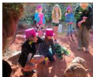
Inside the Radiated Tortoise enclosure