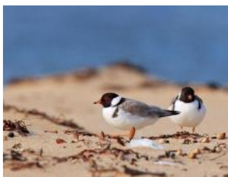
Above: The Hooded Plover lays its eggs in shallow scrapes on the beach or in the dunes from August to March.

bird life western Australia and you will find the birdlife Australia site. There is a link to Country Branch Newsletters where you will find Cape to Cape newsletters. The Cape to Cape Bird Group cover the area from Cape Naturalise to Cape Leeuwin. Excursions are listed in the newsletter, and general public are welcome to join in.