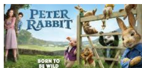
Peter Rabbit at the Augusta CRC 10am Oct 4

6 watched Peter Rabbit as part of CinefestOz, and all reports (old and young) were that it is a wonderful movie! And this will be a perfect opportunity for a second viewing!