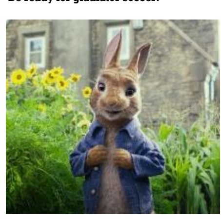
CinefestOz School Movie—Peter Rabbit