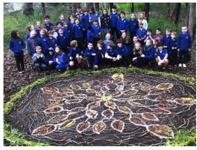
Our beautiful mandala created in the School Bushland.

On Monday 23 July, we all met together in Room 4 with Cloherty. Elaine Elaine explained to us that Land Art international art movement where artworks are made outside in nature and use natural materials. Elaine's presentation showed us artworks from around the world. Elaine spoke of the local birds and the different patterns of feathers including the Redtailed Black Cockatoos. In our class groups we then drew our own feathers based on the real ones, and headed outside to collect natural materials from around the school to make our own feather in the bushland. Many children were excited to invite their parents after school into our school bushland to see the beautiful mandala we created together. We look forward to Elaine working with us over the next three Mondays where we will explore how artists have