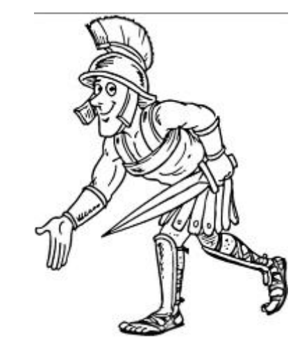
Be ready for gladiator soccer.

In the afternoon we will have fun dressing gladiators before a soccer game, weather permitting. Buona giornata!