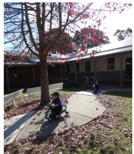
L-R: Kindy 2019 Application to Enrol close on Friday 20 July 2018, so please act!