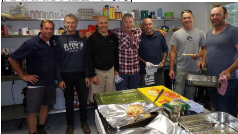
Above: Behind the scenes with our terrific volunteer dads "The Unbelievables" the Mothers' Day Breakfast.