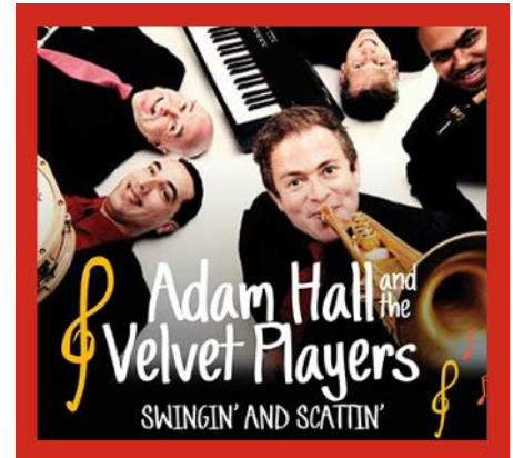
Above: Musica Viva not to be missed on Friday 25 May at Augusta Primary.

Action: please return the permission note for your child/children to attend this excursion at Augusta Primary School and make your payment $6.50 for children P-6 as soon as possible.