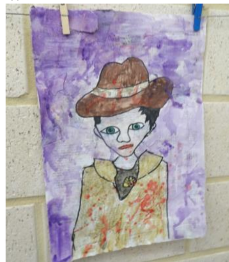
Above: ANZAC digger by Neve, Year 5, book print collage and water colours.