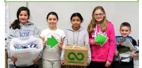
Above: Support our TerraCycle program!