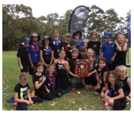
Above 2018 Champions—some of the Emus!