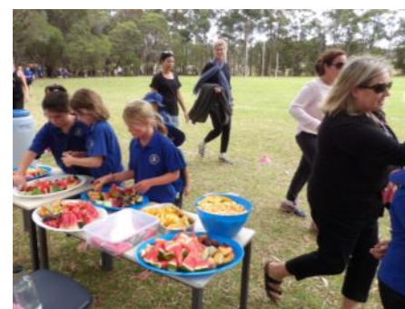
L-R Children, parents and teachers all doing their fun run laps.