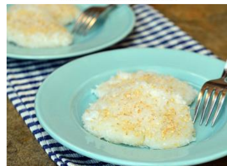
Above: Palitaw—a sweet, sticky rice cake a favourite from the Philippines—is on the recess menu for Harmony Day.