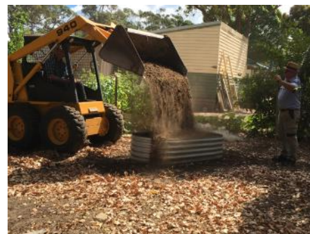
Above Ray Colyer supervising the manure delivery to the school's garden.