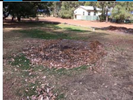
Above The remains of the trees grinded near the school septic system—keep clear!

P&C membership is only $1 and needs to be paid as soon as possible to ensure you're covered for insurance when volunteering. Membership forms are available from Admin, so please complete one when making your payment.