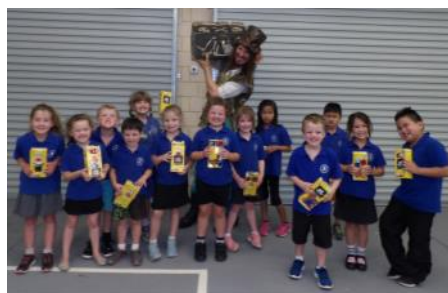
Above Pirate Man and the children with the treasures they created.