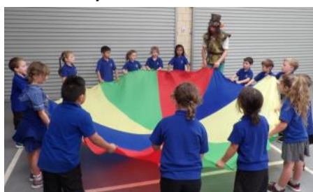
Above By simulating the ocean with the cloth, the children then "swam" beneath the waves they created with the Pirate Man.

"Be kind whenever possible. It is always possible." - Dalai Lama