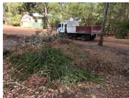
Above Green waste being removed from the school's rear access.