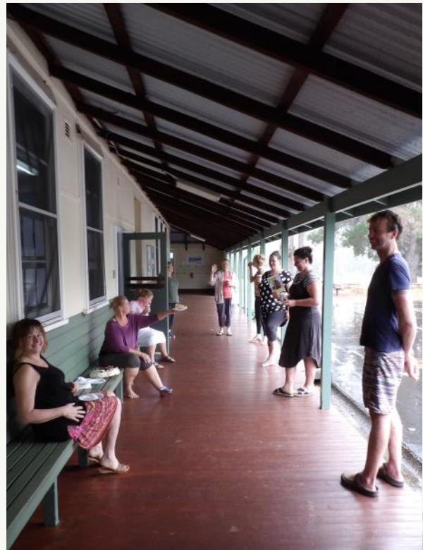
Above: Staff setting a physical distancing example.

resulting in a relaxing of the physical distancing requirements between students.