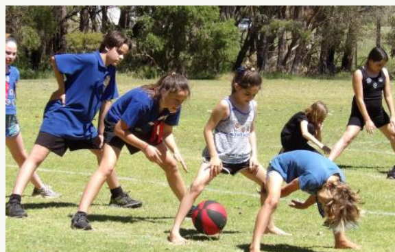
Above: Tunnel ball team Year 5/6 mixed in action.