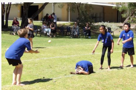
Above: Boomers leaderball team.