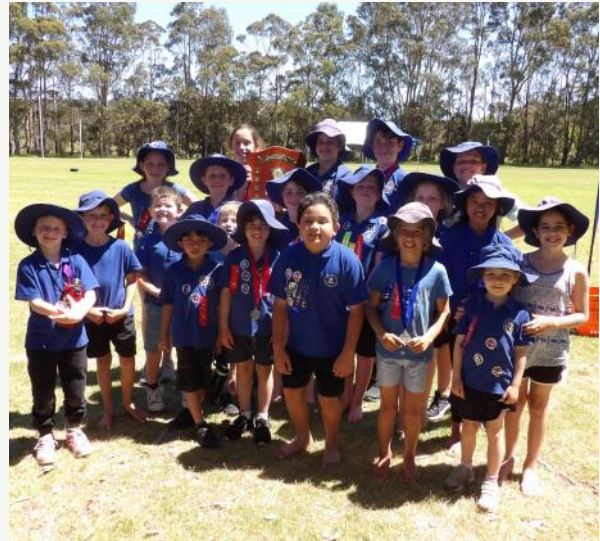
Above: The Boomers (blue) thrived and succeeded on the Faction Sports Day.

The children trained hard in the lead up to this event. They are to be commended for displaying great teamwork and sportsmanship. Well done everyone for giving it your best!