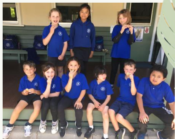
Above Room 3 children taste-testing the spinach and ricotta rolls they made for the Faction Sports Day.